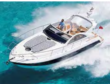
Flexo HWN quickly dries when exposed to moisture making it ideal for marine applications.