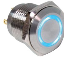
PV6 Series Illuminated*