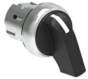
Selector switch actuators long lever - 2 position LPSS22