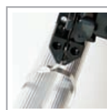
Tensioning and cutting off stainless steel cable ties