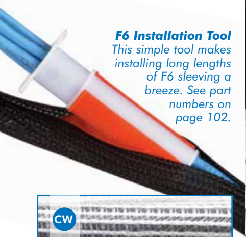
F6 Installation Tool This simple tool makes installing long lengths of F6 sleeving a breeze. See part numbers on page 102.

F6N will bend to a tight radius without distorting or splitting open, and unlike full rigid tubing, will not impair or affect the flexibility of harnesses. F6 allows for addition or removal of wires without disassembly.