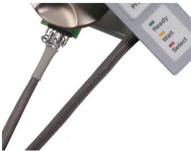
Protect component wiring leads from heat and abrasion with Insultherm Tru-Fit for an attractive and permanent finish.

Insultherm Tru-Fit provides a sturdy, long lasting, and inexpensive insulation solution. It is flexible and expandable, and can easily be installed over applications with irregular shapes and tight turns. Standard colors are Black and Natural, but other colors are available by special order. Contact your account representative for details.