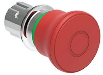
Mushroom head pushbutton, Latch, pull to release Ø 40mm/1.6" LPSB674