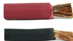
WAYTEK 6GA SGR Battery Cable Item #SGR6-2-250 Item #SGR6-0-250