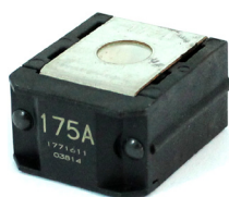
ZCASE® Fuse WAYTEK # 45592