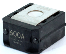
LITTELFUSE® ZCASE® Mega Starter Fuse 600A Item #45623