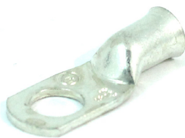
MOLEX® Tinned Copper Eyelet, 5/16 Stud Item #36164