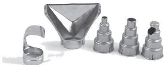
Quality attachments for professional applications

Low = 9 CFM & No Heat Medium = 9 CFM & 600°F (320°C) High = 18 CFM & 1200°F (650°C)