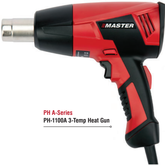
PH A-Series PH-1100A 3-Temp Heat Gun