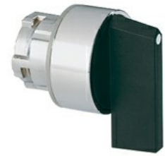
Selector switch actuators long lever - 2 position 8LM2TS2